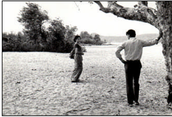
Aranyer Din-Ratri (Days and Nights in the Forest)