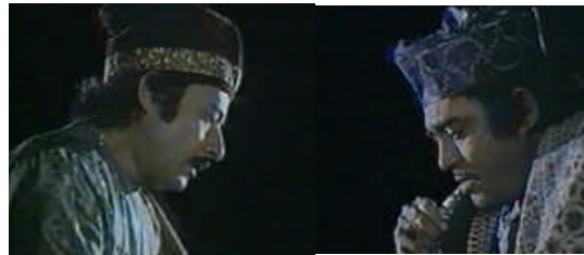
Shatranj Ke Khiladi (The Chess Players)