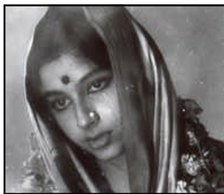
Devi (The Goddess)