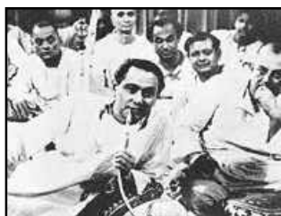
Jalsaghar (The Music Room)