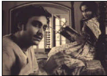
Charulata (The Lonely Wife)