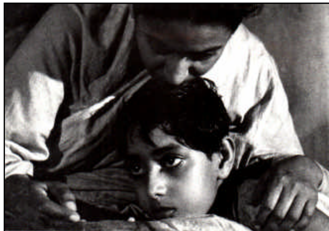
Aparajito (The Unvanquished)